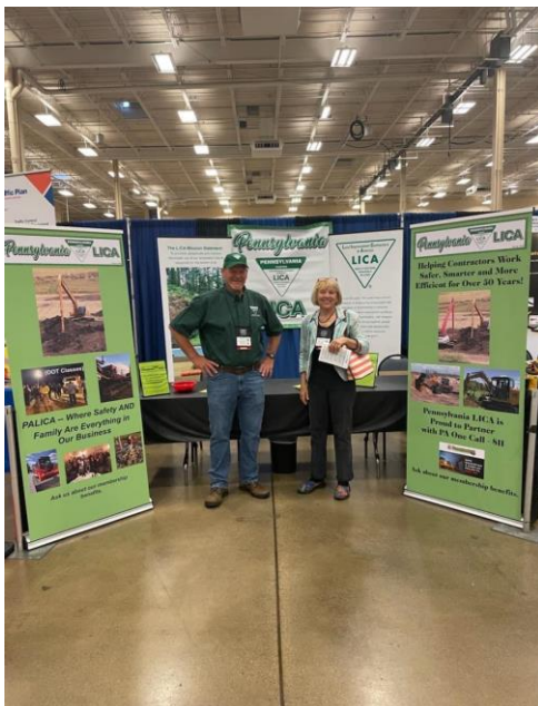
Pittsburgh 811 Show in June