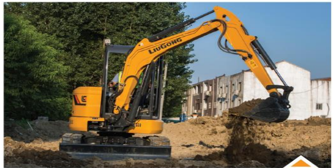
The 9035EZTS is the first zero-tailswing model from LiuGong in the 3.5-metric-ton class. Operating weight is 8,510 pounds, and power comes from a 24.4-horsepower Yanmar engine. A mechanical quick-coupler and 0.14-cubic-yard bucket are standard.