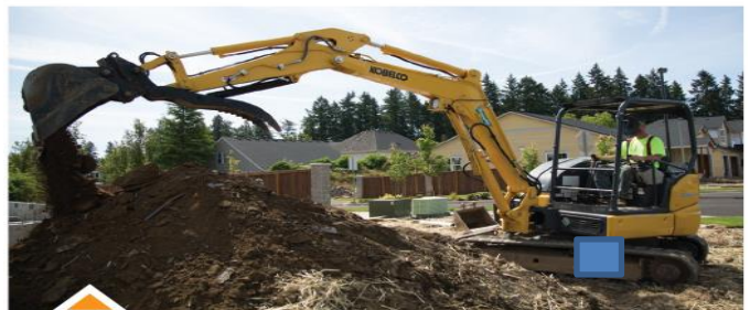
With an operating weight of 10,300 pounds, the SK455-RX-6E from Kobelco has a maximum reach of 18 feet 8 inches at ground level and a maximum dig depth of 11 feet 3 inches. It runs on a 37.4-horsepower Yanmar engine.