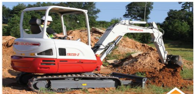
The Takeuchi TB235-2 has a heavy-duty dozer blade with float as standard, and a power angle blade with bolt-on cutting edge is optional. Maximum bucket breakout force is 9,127 pounds, and maximum arm digging force is 3,889 pounds.