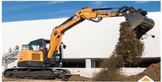
At 12,940 pounds, the CX60C is the largest compact excavator in the Case lineup. It features a short-radius tailswing design, 9,190 pounds of bucket digging forces and a 64.7-horsepower engine.

Modern designs and materials have further enhanced their durability.