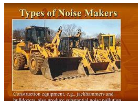
Construction equipment, e.g., jackhammers and bulldozers, also produce substantial noise pollution.